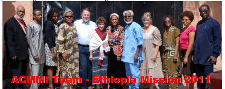
ACMMI Team - Ethiopia Mission 2011

We did not know how long this will take and not wanting further delay of the mission, the team left Addis Ababa for the remote and medically underserved village of Goro in Oromia region where our first field station was started. I was left behind in Addis Ababa to attend to the issues of getting our medications released. ACMMI had to buy locally available medications and supplies in order to serve the health needs of the people we encountered. Although it was a predominantly Muslim community they happily welcomed us and were very cooperative in ensuring that our service to the community was hitch-free. HCOGE already had a footprint in the community in the form of a primary school as a practical tool for the Gospel. Our humble effort further watered the grounds and we pray that the seeds sown in the hearts and lives of these Oromo people will grow to produce a great harvest for the Kingdom.