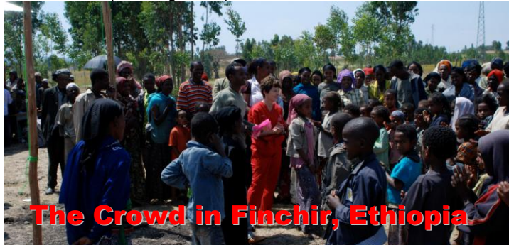
The Crowd in Finchir, Ethiopia

Other stations of service included Finchir, Medo, Hawassi, and Waliso. In all we served in 5 communities, attended to 1104 patients (406 children and 698 adults) 4 surgeries and 2 hospitalized (Kwashiorkor and Nephrotic syndrome). Most of these were predominantly Muslim communities in remote medically underserved areas. However, they welcomed us and some even volunteered as translators to facilitate our work in the area. In Medo, we were even stationed at a Christian school adjacent to a mosque but the people were very friendly, worked cooperatively with us, and blended with our team seamlessly. (Cont'd)