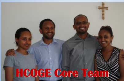
HCOGE Core Team

ACMMI (www.acmmi.org) 8300 Bissonnet, Suite 300 Houston, Texas 77074 Tel: 713-240-0235