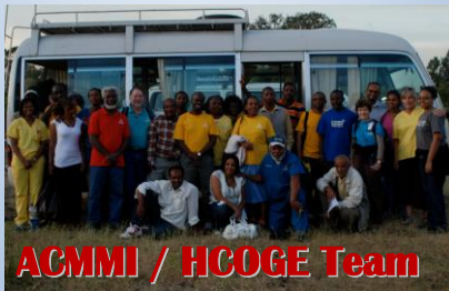
ACMMI / HCOGE Team

Go into all the world and preach the gospel to all creation. Mark 16:15