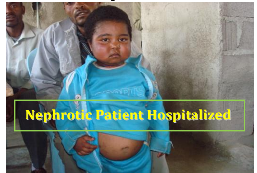
Nephrotic Patient Hospitalized