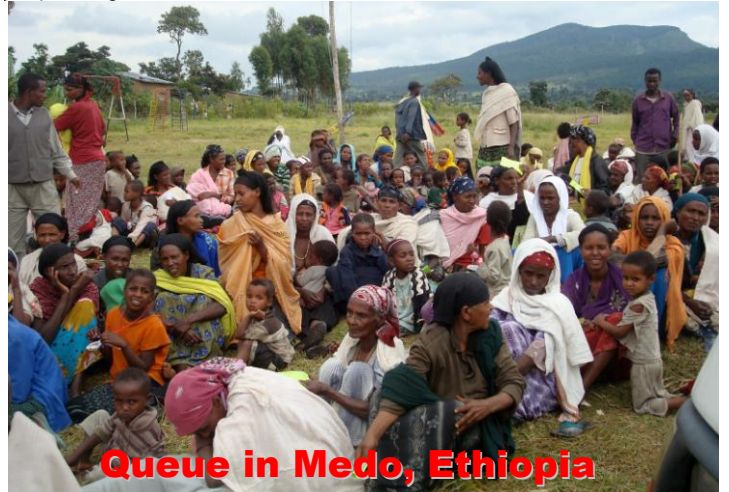
Queue in Medo, Ethiopia

ACMMI team of 13 volunteers departed Houston, Texas on October 24, 2011 arriving Addis Ababa, Ethiopia, the next day. We were warmly received at the airport by our local partner, Harvest Church of God, Ethiopia (HCOGE) led by Bishop Hiruy Tsige. It was at the airport that we faced our first challenge. Agents of the Ethiopian pharmaceutical regulating authority were not readily available at the airport due to our late arrival time. All our medications and supplies were therefore seized and held in storage pending their action. When they arrived the next day we then found out that there were several bureaucratic hoops we had to jump through before the medications would be released to us.