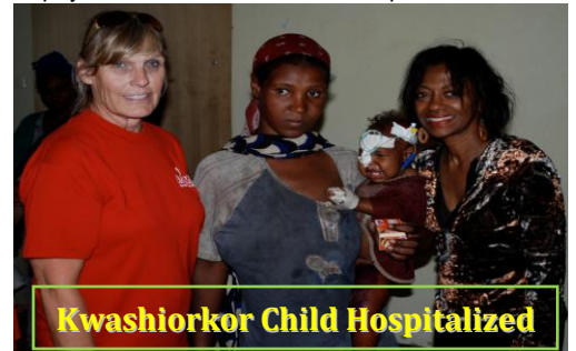
Kwashiorkor Child Hospitalized

compassionate team members contributed funds to pay the estimated 3-week hospitalization cost.