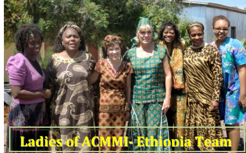
Ladies of ACMMI- Ethiopia Team

After much prayer and submission to the Lord, I took on the challenge by joining ACMMI team of highly dedicated and skilled professionals on a medical mission trip to Ethiopia. As a health care provider residing in a developed country, I have become content in my comfort zone and took such affluent lifestyle for granted.